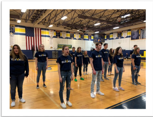
Elevate A Capella

“Those being named Commended Students have demonstrated outstanding potential for academic success”, commented a spokesperson for NMSC. “These students represent a valuable national resource; recognizing their accomplishments, as well as the key role their school play in their academic development, is vital to the advancement of educational opportunities and encourage them as they continue their pursuit of academic success.”